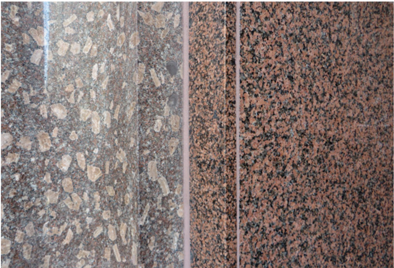
Shap Granite and fine and coarse grained Balmoral Granites at 22, Old Bond Street.

Zanetti & Company Ltd: http://www.zanetticompany.com/default.asp