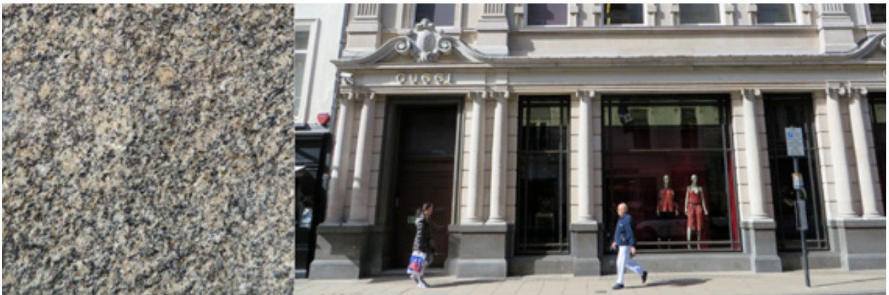
Gucci, 36-8 Old Bond Street. Left detail of the granite used in the foundations, field of view is ~ 8 cm.

The Ionic columns and upper stories are of Portland Whitbed . This stone shows traces of burrows left by marine organisms, 'bioturbation'. This is particularly clear in the columns.